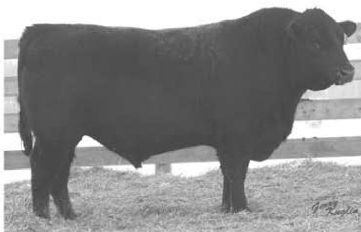
ROYAL ALLIANCE DRCC 5123R LOT 11