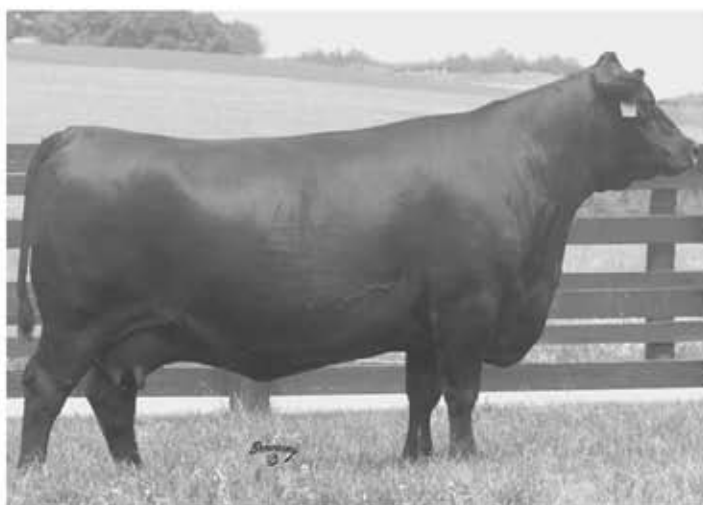
CANE RIDGE PERSEPHONE 6531 GRANDDAM OF LOTS 8 - 11 and 33