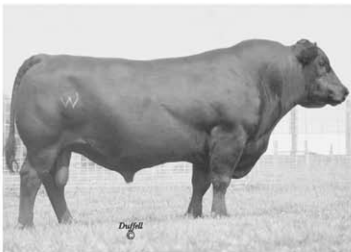
WHITESTONE SURVIVOR N088 SIRE of LOT 30 and 31

The highest % IMF bull in his group, this guy combines a low birth weight with superb carcass trait potential. If you like moderate framed, easy fleshing cattle make sure to look him up on sale day.