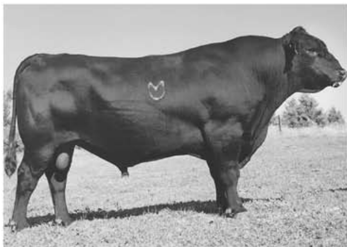
B/R NEW DESIGN 036 SIRE of LOTS 8 - 10

A full brother to Lots 8 & 9. He is the highest gaining of the three flushmates and had an ADG of 3.96 on grass this past summer. We have three full sisters which are destined to become great females in our program. The Persephone family makes up a large part of our breeding herd.