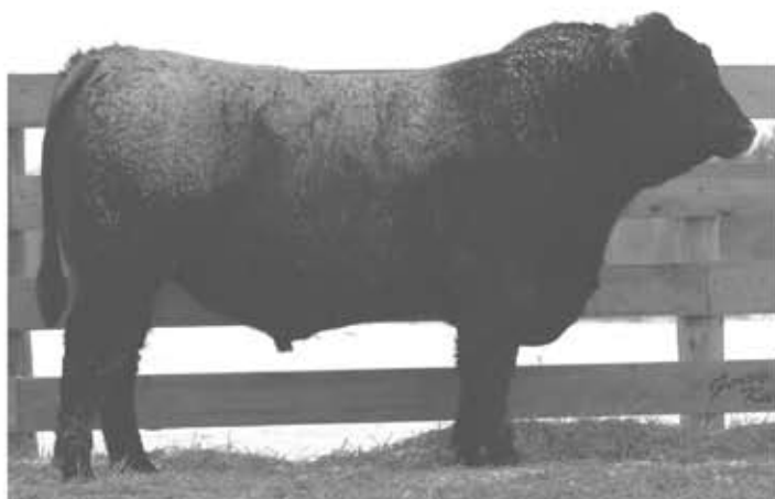
ROYAL NEW DESIGN DRCC 5131R LOT 10