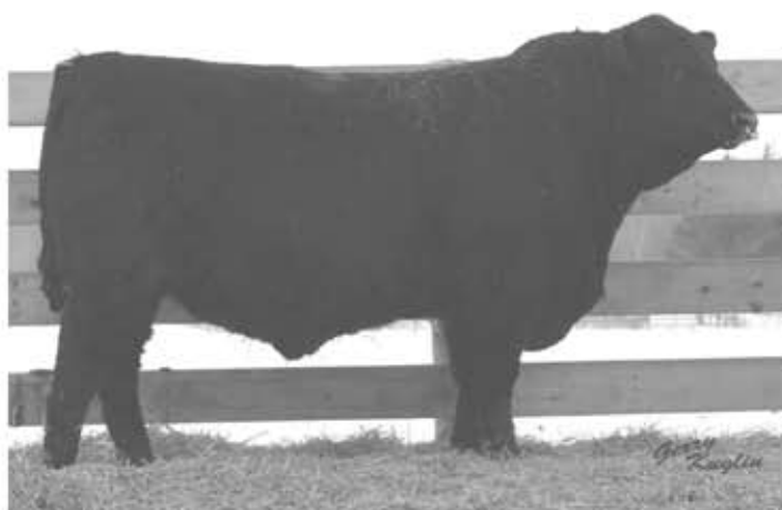
ROYAL FORTE DRCC 5138R LOT 3