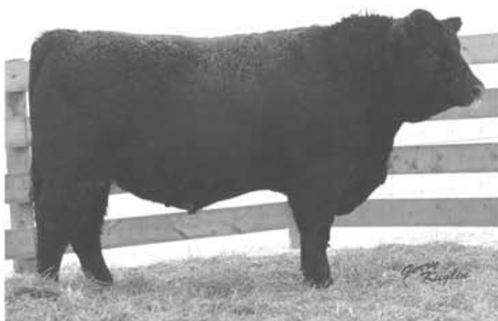
ROYAL ALLIANCE DRCC 5146R LOT 12