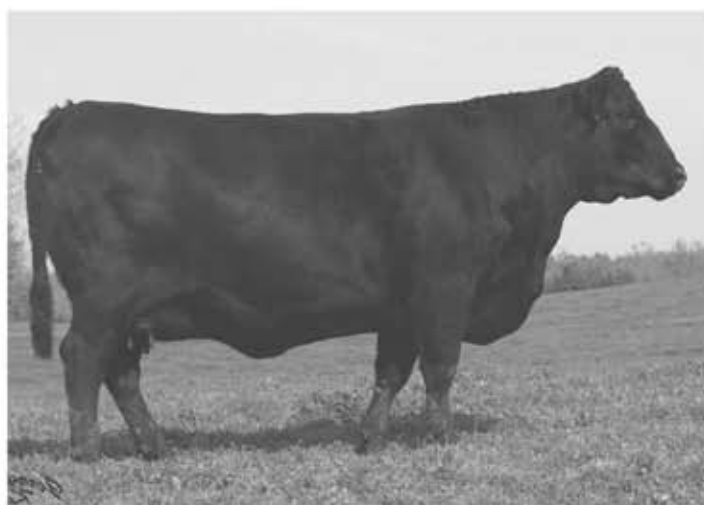
ROYAL PERSEPHONE DRCC 3110N DAM of LOT 3

Selling 2/3 Interest and Full Possession.