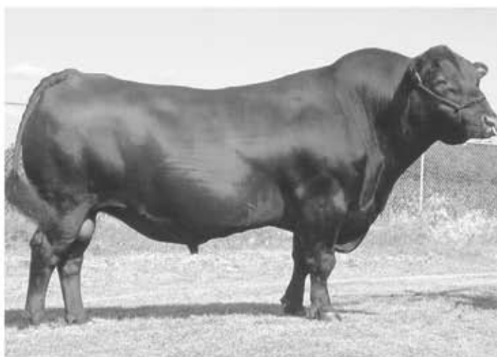
G A R RETAIL PRODUCT SIRE of LOT 14 - 23

With a powerful sire and out of a cow from our great Lucy family this bull comes with built in performance and carcass traits. His ultrasound data is very good and he had a high Lean Meat Yield of 65.5. His birth weight and pedigree will definitely work for heifers.