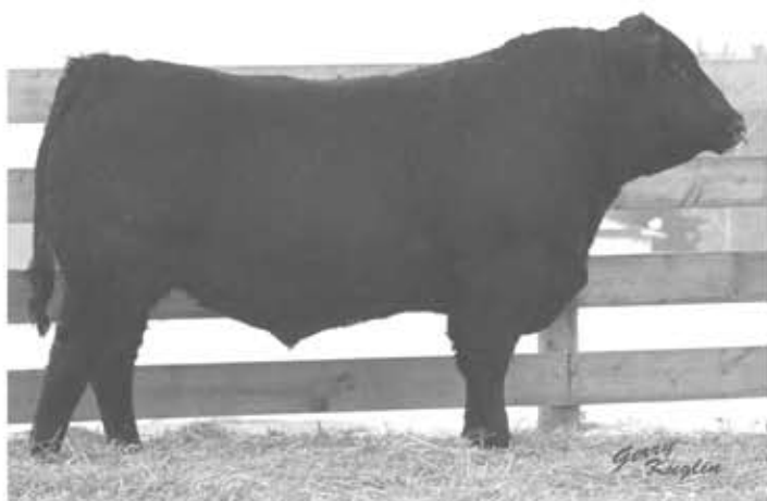
ROYAL TRAVELER DRCC 5144R LOT 2