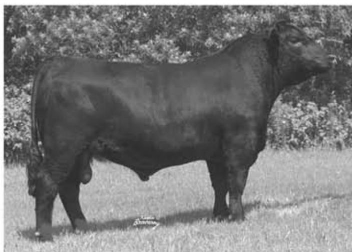
ROYAL TRAVELER DRCC 5040R FULL BROTHER TO THE DAM of LOT 23

The pedigree this bull carries contains a tremendous amount of predictability and performance. He stems from the top producing Lucy cow family which has produced some of the best individuals in the DRCC program. A full brother to his dam, Royal Traveler DRCC 5040R, was the top selling bull in our 2006 sale to Ole Farms, Athabasca, AB.