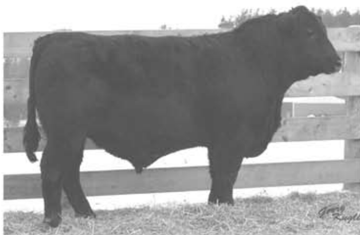
ROYAL RP DRCC 6011S LOT 15