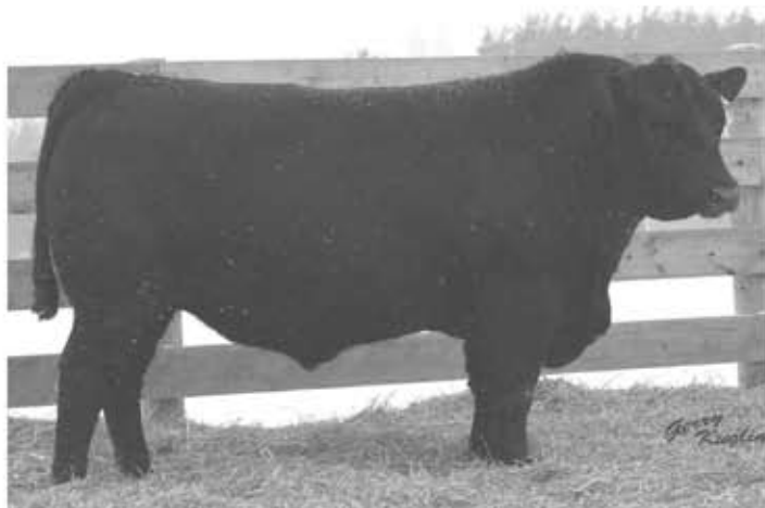
ROYAL FORTE DRCC 5129R LOT 4