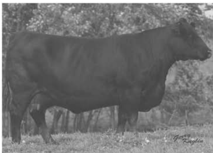
BEAUTY OF THISTLEDEW 26D DAM of LOT 4

This bull is bred to be a calving ease sire with added performance. His dam is one of our most powerful cows and a maternal sister, Royal Beauty DRCC 3115N, is a donor prospect for Benchmark Angus, Lethbridge, AB. He is thick made and will sire easy keeping cattle which will make great replacements.