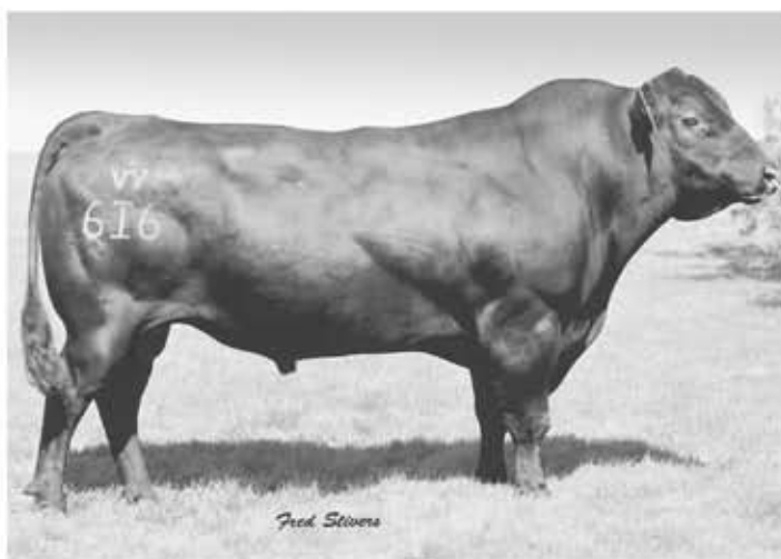
RITO 616 OF 4820 6807 MATERNAL GRANDSIRE of LOTS 16 - 18