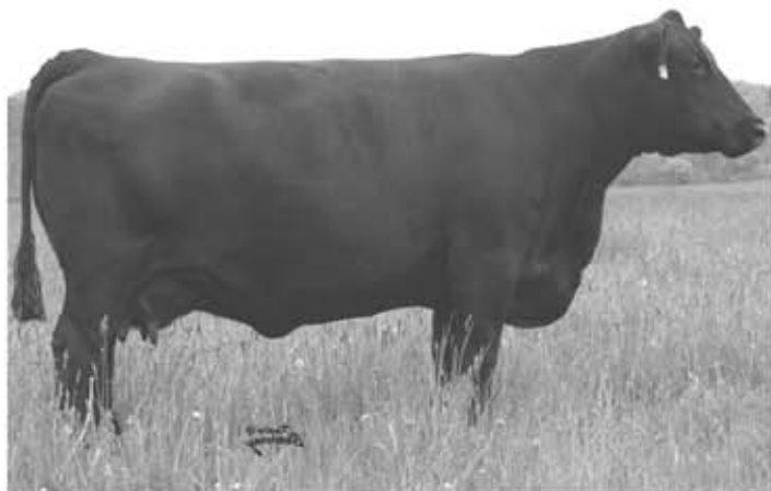
THOMAS BLACKBIRD PRIDE 0137 DAM of LOT 15

This 3/4 brother to Lot 14 has exceptional performance and a huge scrotal measurement. He offers some extra growth in a long sided package. His CAA Elite Dam is one of our very top producers with weaning index of 107 on 4 calves. A maternal brother, Royal Precision DRCC 5024R, serves as a herdsire for Stoney Creek Feedlot, Wyoming, ON.