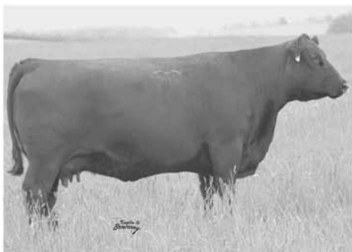
THOMAS ELBINA 0183 DAM of LOT 27