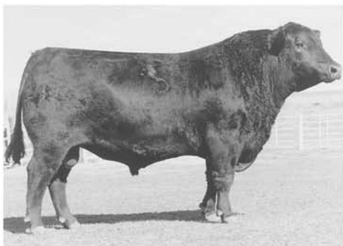
ALBERDA TRAVELER 416 SIRE of LOTS 2, 24, and 25

A triple bred Traveler who is destined to pass on great maternal characteristics. His sire has been a mainstay in our program because of his ability to pass on doability, great dispositions and maternal performance. This bull could help you build a beautiful cow herd.