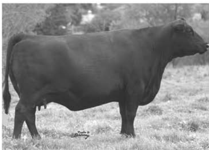
THOMAS LUCY 9160 DAM of LOT 2

A tremendous Herdsire prospect that is as heavy muscled as you will find. He has been a stand out since he was born and his dam is a valued donor in our program. A full brother, Royal Traveler DRCC 3083N, is a herdsire for Antworth Cattle, Upper Knox-ford, NB. A maternal brother, Royal Fix It DRCC 2106M, is a herdsire for Macson Farms, Van Kleek Hill, ON.