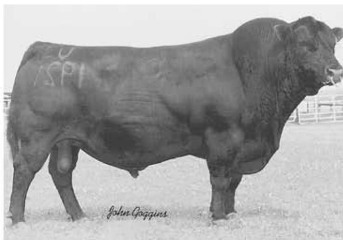
PAPA FORTE 1921 SIRE of LOTS 3 - 6 , 32 and 33

A young calving ease package that is loaded with birth to weaning performance in a moderate frame. He stems from the Persephone family which is such a big part of our program. Full brothers to the dam of this bull have served as herdsires for DRCC, Macson Farms, Van Kleek Hill, ON and Mill Creek Farms, Cambridge, ON.