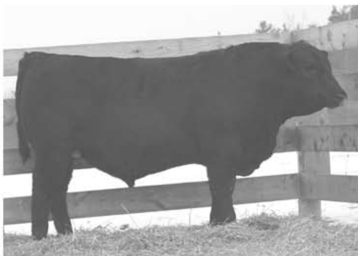
ROYAL RP DRCC 6027S LOT 20