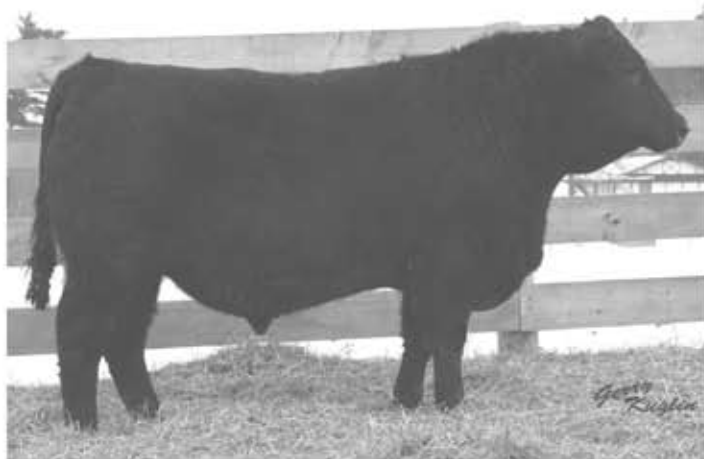
ROYAL PREDESTINED DRCC 6036S LOT 27