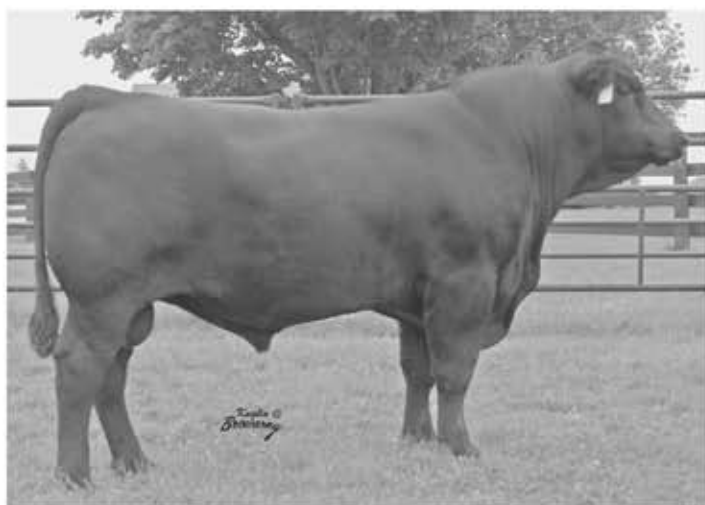
ROYAL ALLIANCE DRCC 3025N SIRE of LOTS 12 and 13

This deep sided herdsire prospect is a favourite of many farm visitors. His sire, a son of the great Alliance 6595, is the senior herdsire for Knightsbridge Farm, Morpeth, ON. His dam is a donor in our program and is consistently one of our best producers. She has two daughters in our herd who both do a great job.