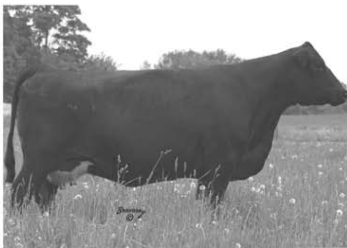
THOMAS MISS LUCY 8248 DAM of LOT 20

Selling 2/3 Interest and Full Possession.